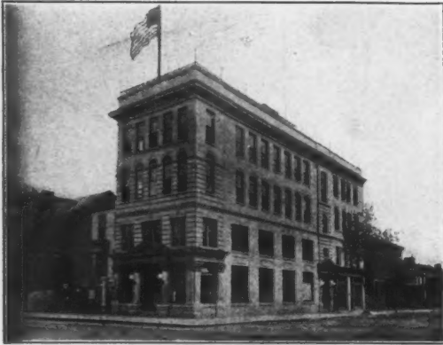
Future Home Office Southern Aid Society of Va., Inc. N.W. Cor. 3rd & Clay Sts. Richmond, Va.